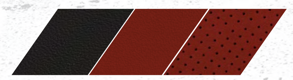
LAGUNA LEATHER TRIM WITH LAGUNA AXIS II PERFORATED INSERTS AND ACCENT STITCHING, BLACK AND DEMONIC RED – OPTIONAL SRT® 392 AND SRT® HELLCAT