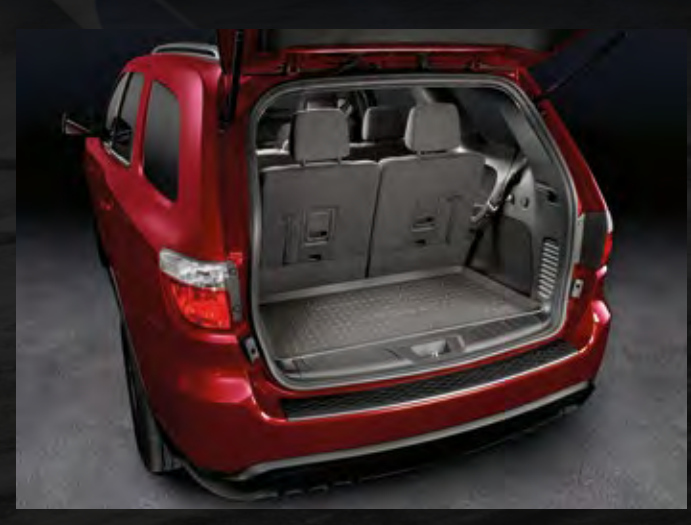
////// PART. NO. 82212280 DURANGO CARGO TRAY