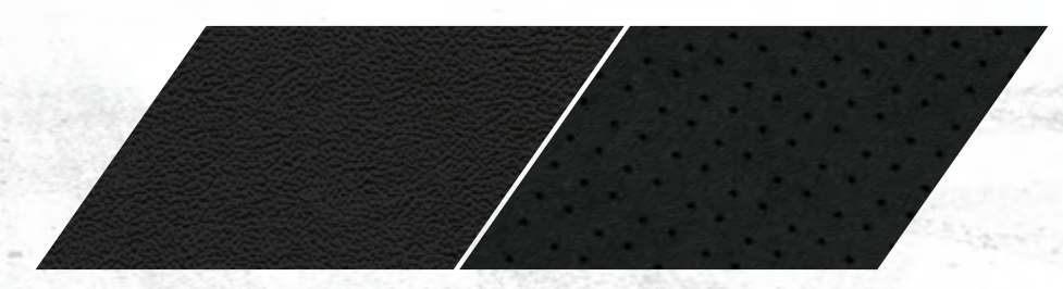
NAPPA LEATHER TRIM WITH NAPPA AXIS II PERFORATED INSERTS AND ACCENT STITCHING, BLACK – STANDARD ON R/T PREMIUM