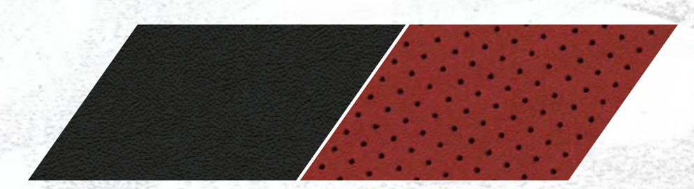
NAPPA LEATHER TRIM WITH NAPPA AXIS II PERFORATED INSERTS AND ACCENT STITCHING, BLACK AND RED – OPTIONAL ON R/T PREMIUM