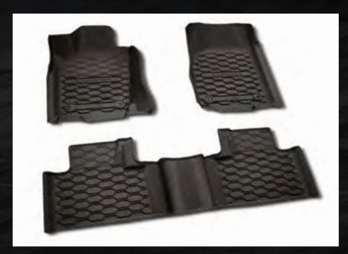
////// PART. NO. 82215970AA RUBBER FLOOR MATS 1ST & 2ND ROW, CAPTAIN SEATS