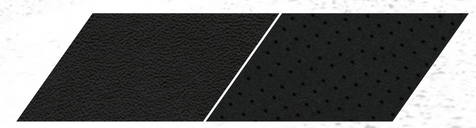
LAGUNA LEATHER TRIM WITH LAGUNA AXIS II PERFORATED INSERTS, BLACK – STANDARD ON SRT ^{\odot} 392 AND SRT ^{\odot} HELLCAT