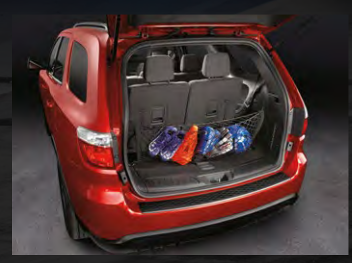
////// PART. NO. 82213308 CARGO NET, ENVELOPE STYLE