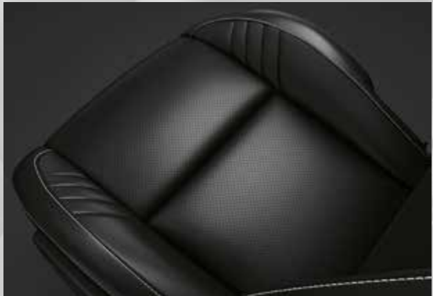
Black Laguna Performance Leather Seats Challenger & Charger SRT® Hellcat

Picture shows 2020 Dodge models with optional equipment. For consumption and emission data please see page 39.