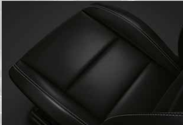
Black Nappa Sport Seats Durango R/T & SRT®