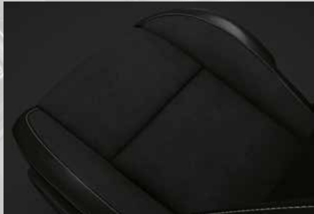
Black Nappa/Black Alcantara® Sport Seats Challenger & Charger R/T Scat Pack